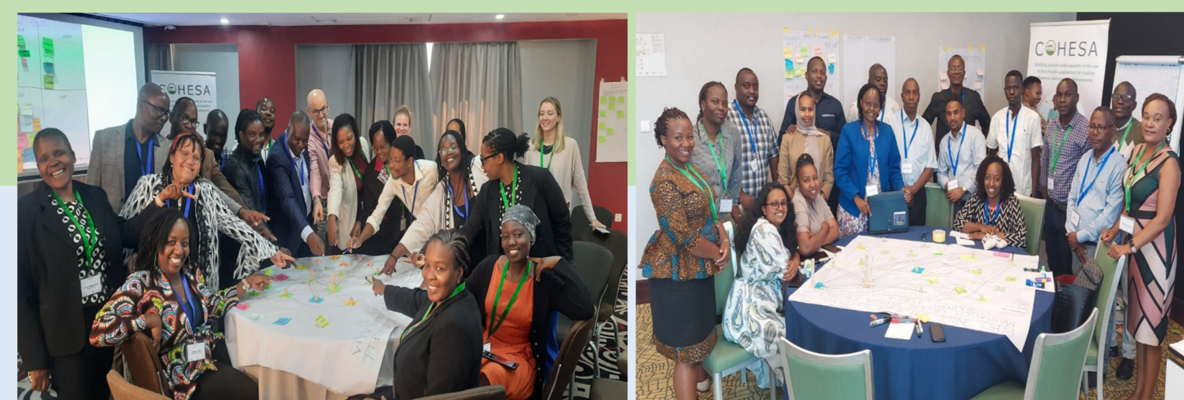
Fig. 2. Photo showing net mapping Training of Trainers for the Southern (left) and East African (right) countries