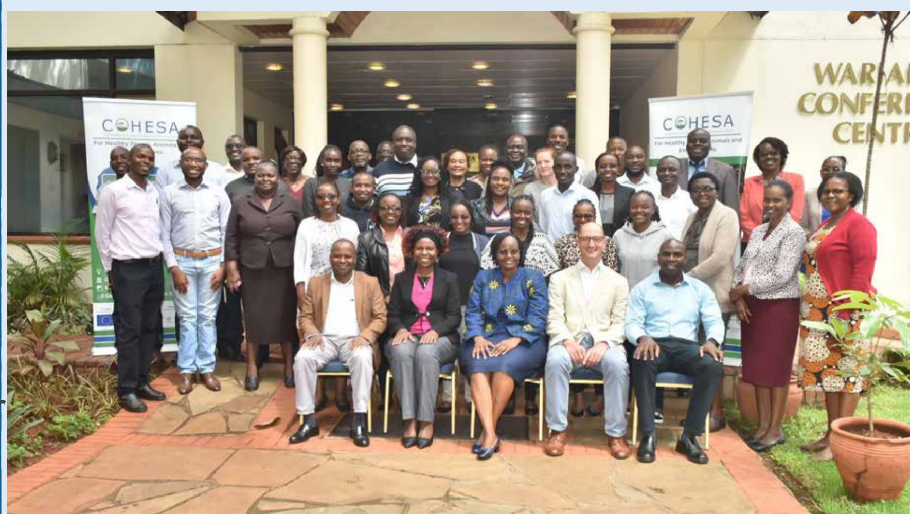
COHESA-Kenya team with teams participating in the sandpit.