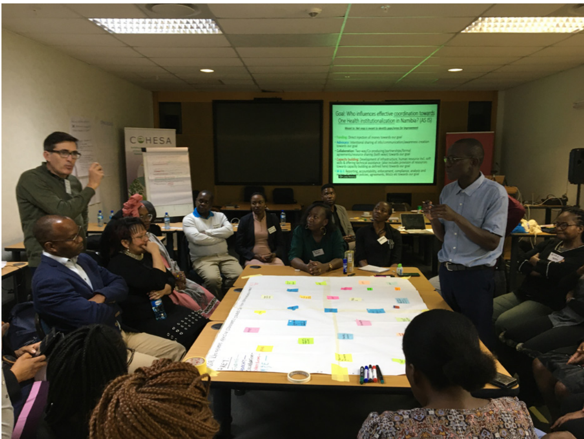
Fig. 2. OH netmapping.