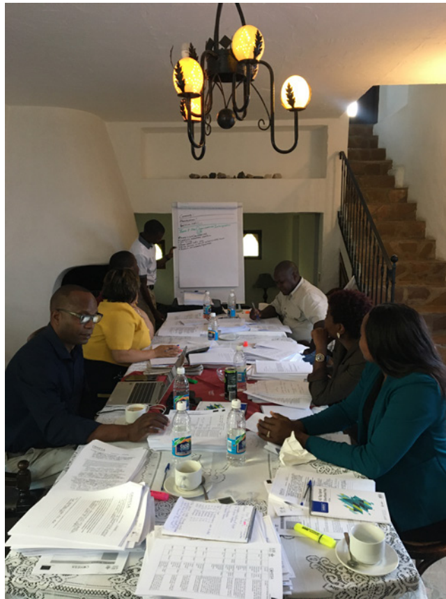
Fig. 1. OH data analysis meeting.