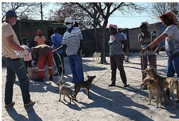
Fig. 5. Vaccination of dogs in a village centre in northern Namibia.

Collaborative interactions among the participants were also driven by the need for research, especially among academia and the ministries. Notably, the MEFT interacts with universities to research wildlife diseases. In addition, the MOHSS and MAWLR also interact with academia and other organizations, such as the Friedrich-Loeffler-Institute (FLI) and Robert Koch Institute (RKI), in studying zoonotic diseases such as rabies. Rabies is 100% preventable through vaccination, but vaccination coverage is low due to the non-availability of all susceptible dogs. Stray dogs are a particular challenge. Figure 5 shows the implementation of oral rabies bait trials in Namibia's Northern Communal Areas (NCA). Stray dogs are difficult to reach, and oral baits offered a possible solution to low vaccination coverage. These collaborative research projects between academia, government, and the private sector improved understanding of OH issues like rabies management in Namibia; however, there were few reports of such shared research programs.