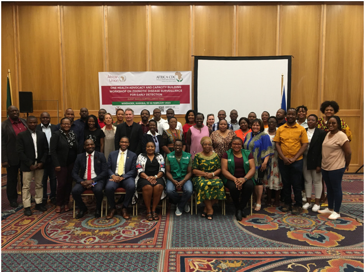
Fig. 4. OH advocacy strategy workshop.