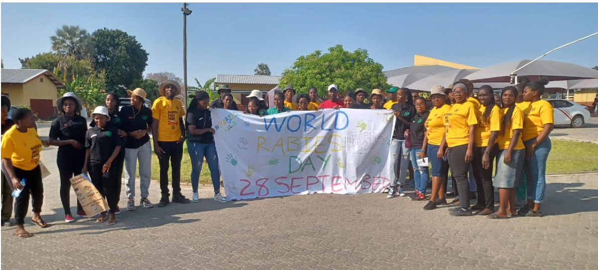
Fig. 6. World rabies day.

The importance of OH is gaining significant recognition throughout the country. The recent Media Science Café, organized by the Namibia project team, received overwhelming support from journalists, indicating a strong desire for OH-related information. This highlights the need to promote OH activities extensively. The World Rabies Day celebrations, led by the MAWLR DVS, praised the country's efforts to raise awareness of OH across different sectors (Fig. 6). While the ministry focused on rabies, the involvement of key ministries such as MOHSS and MEFT showcased a positive collaboration and progress in the right direction. However, there was limited feedback in the BKII, FGD, and from the desktop review to show any other examples of OH implementation happening in Namibia at the time of the study.