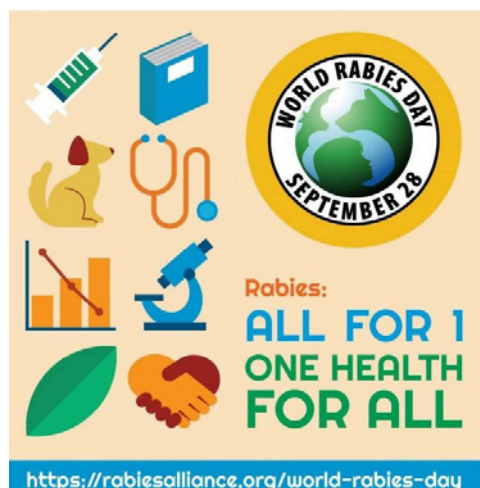
Fig. 7. Rabies advocacy pamphlet from shared One Health efforts between government and private sectors to end rabies transmission to humans.

vaccination campaigns, making it a cost-effective approach with a wider outreach. Through these efforts, the disease has been controlled at its source, leading to a significant reduction in human deaths and casualties.